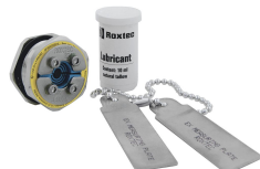
C RS T Ex seal

For detailed information, please visit roxtec.com .